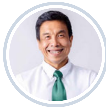
Dr. Chadchart Sittipunt (To be confirmed) Bangkok Governor Thailand